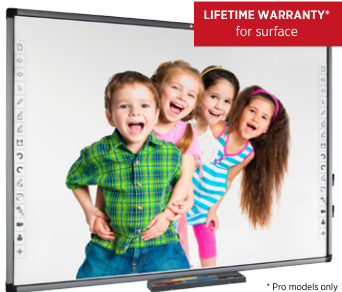
* Pro models only

Every board comes with Avtek Interactive Suite software.