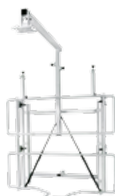
Mounts and brackets – page 33