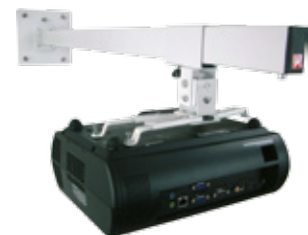
Projector mounts – page 31