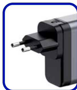
EU Type C