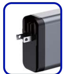
US Type A