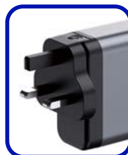
UK Type G