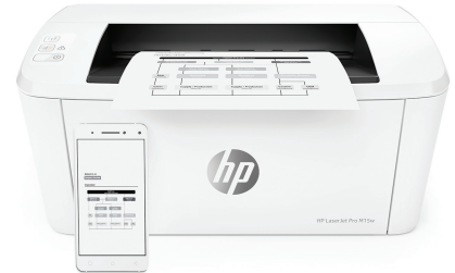
HP LaserJet Pro M15w Printer