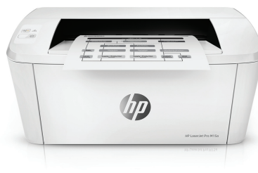
HP LaserJet Pro M15a Printer

Get fast printing that fits your space and your budget. Produce professional-quality results, and print and scan from your smartphone. 2,3